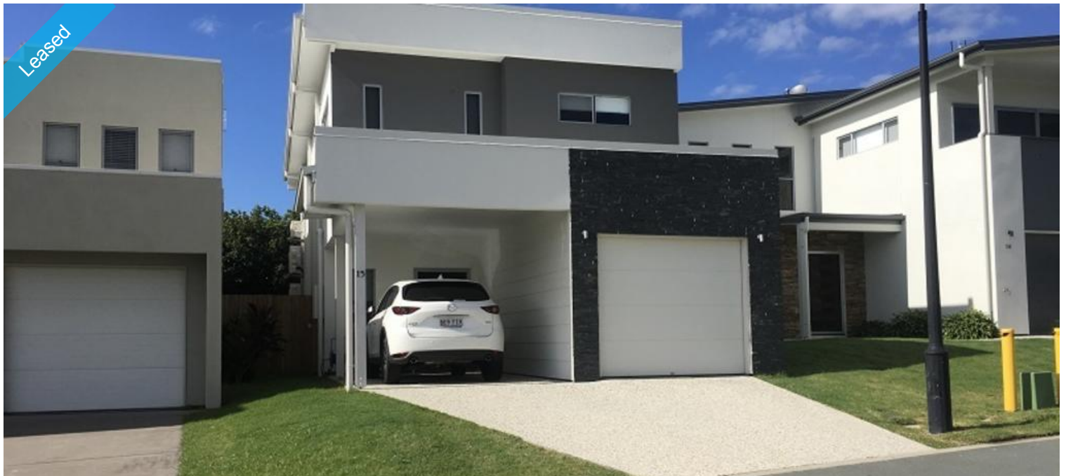
Unit 15, 66 The Avenue, Peregian Springs